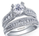
Page 12 ML310