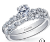
① Page 6 ML889