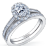
① Page 12 ML872