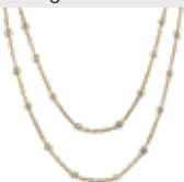
Page 17 ML865