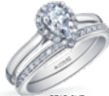
PEAR CUT Page 12 ML167