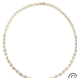
① Page 7 ML866