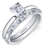
EMERALD CUT Page 16 ML809