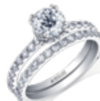
Page 15 ML648