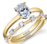
OVAL CUT Page 16 ML810