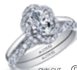
① Page 8 ML890