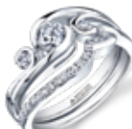
① Page 10 ML127