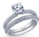
Page 13 ML262