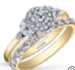
① Page 11 ML891