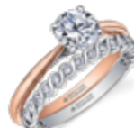
① Page 10 ML741