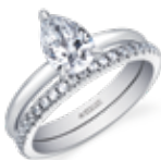
PEAR CUT Page 16 ML812