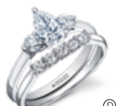
PEAR CUT ① Page 6 ML874