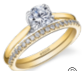
① Page 11 ML820