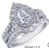
PEAR CUT ① Page 4 ML877