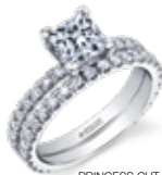
PRINCESS CUT Page 14 ML796