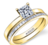
PRINCESS CUT Page 16 ML813