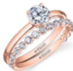
Page 16 ML811