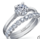
① Page 6 ML876