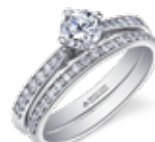
① Page 10 ML761