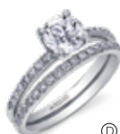
① Page 6 ML500