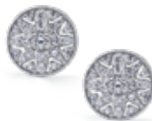
Page 18 ML408