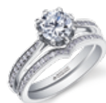
Page 13 ML739