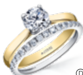
① Page 6 ML869