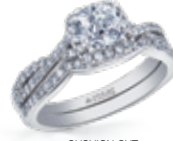
CUSHION CUT Page 12 ML395