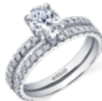
OVAL CUT Page 14 ML574