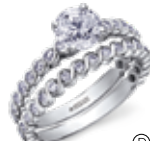
① Page 11 ML512