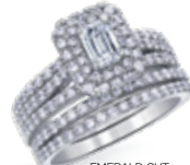
EMERALD CUT Page 12 ML871