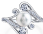
① Page 9 ML880