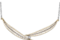
Page 19 ML642