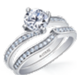
Page 13 ML875